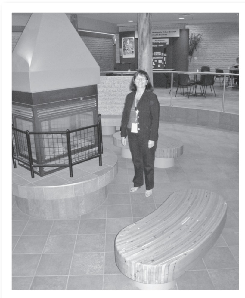
Figure 8 Reception Area, All Nations' Healing Hospital, Fort Qu'Appelle, SK

documents. As the instructor, you need to choose document exercises that generally match the abilities of your learners. Some groups of learners may be able to complete all forms; other groups of learners may not. You are also encouraged to develop exercises for your learners using the documents that are commonly used in your workplace or training environment.