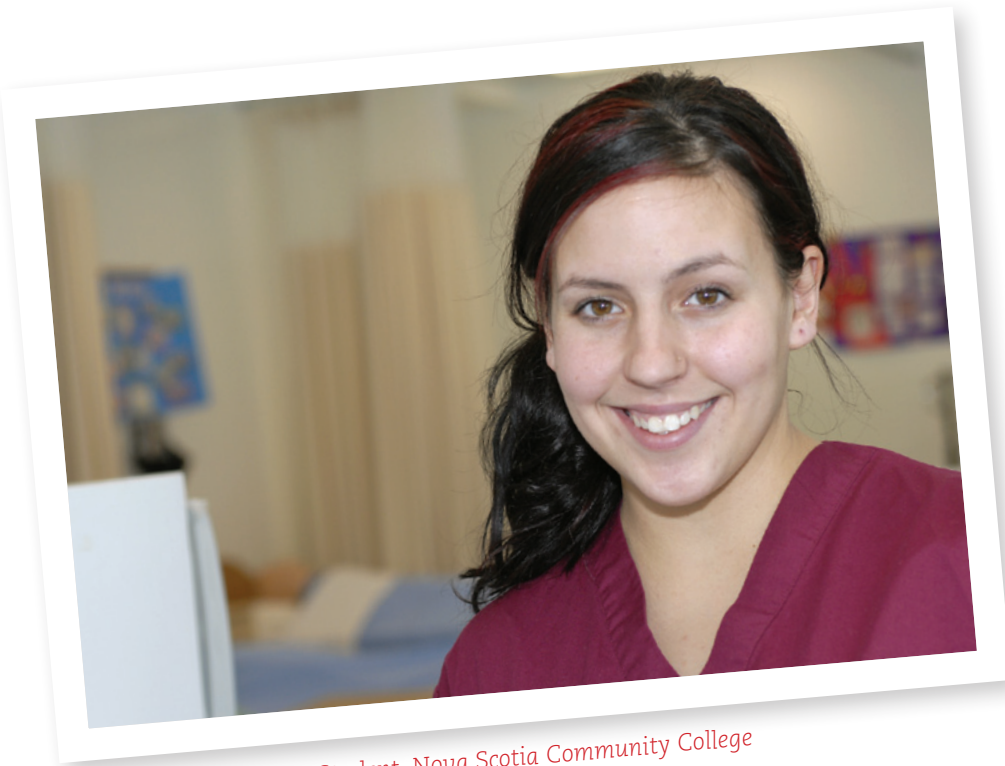
Figure 5 Healthcare Student, Nova Scotia Community College

and forth journey. They must set the stage for learning by presenting or eliciting knowledge that is based in traditional and contemporary life. Then they must show how western ways of analysis can be used to describe and explain things that have long been recognized in traditional life. Instructors can model effective border crossing between their teacher-world and the community of which they are a part.