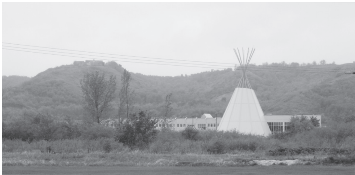
Figure 1 File Hills Qu'Appelle Tribal Council

Craig Herbert – Dean, Developmental & Access Training, Northern Lights College, BC