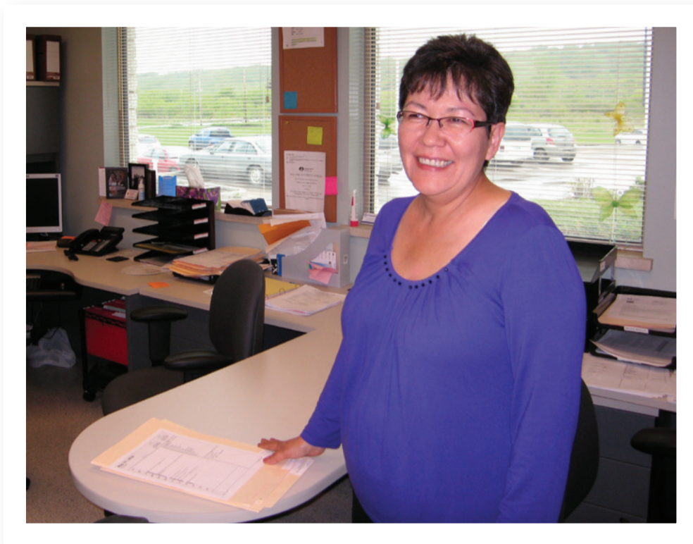
Figure 6 All Nations' Healing Hospital, Fort Qu'Appelle, SK

The complexity of the documents used in these Guides ranges from 1-3 generally, as many of the documents used in entry level healthcare occupations fall into this range of complexity.