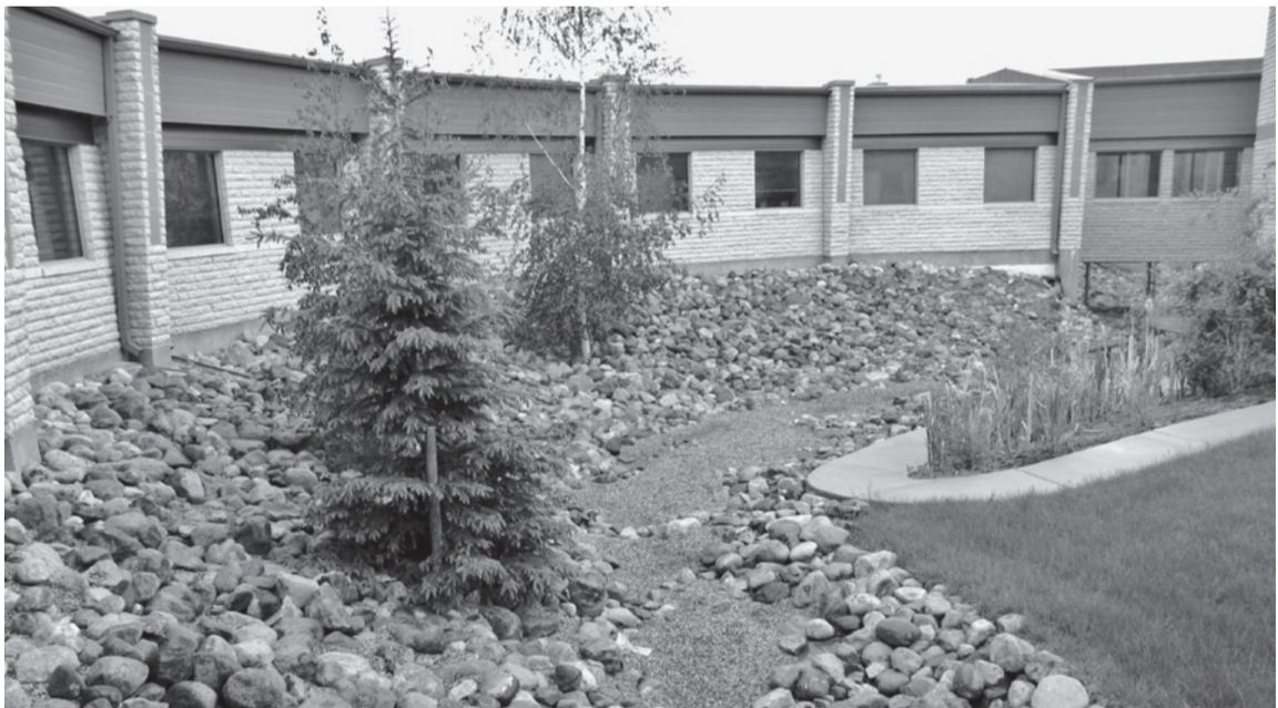
Figure 4 All Nations’ Healing Hospital (centre view), Fort Qu’Appelle, SK