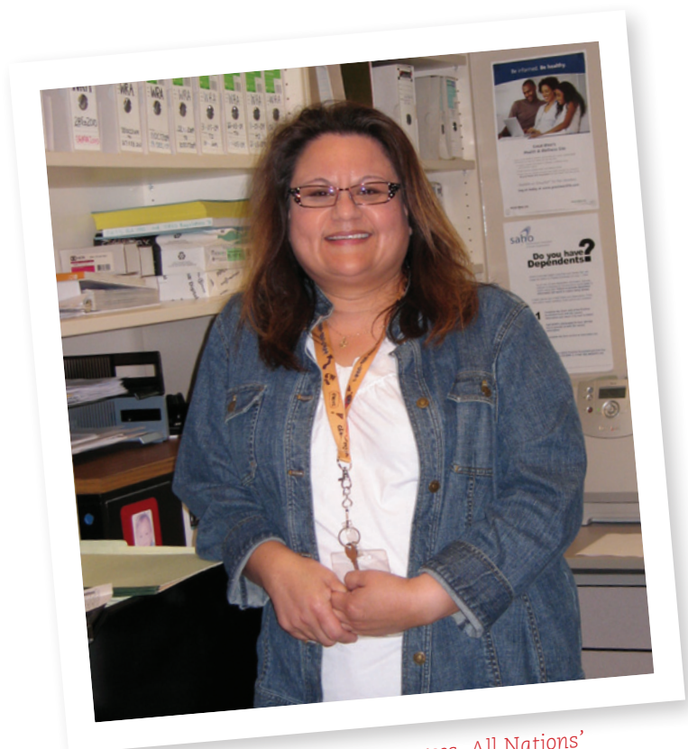
Figure 7 Manager, Human Resources, All Nations’ Healing Hospital, Fort Qu’Appelle, SK