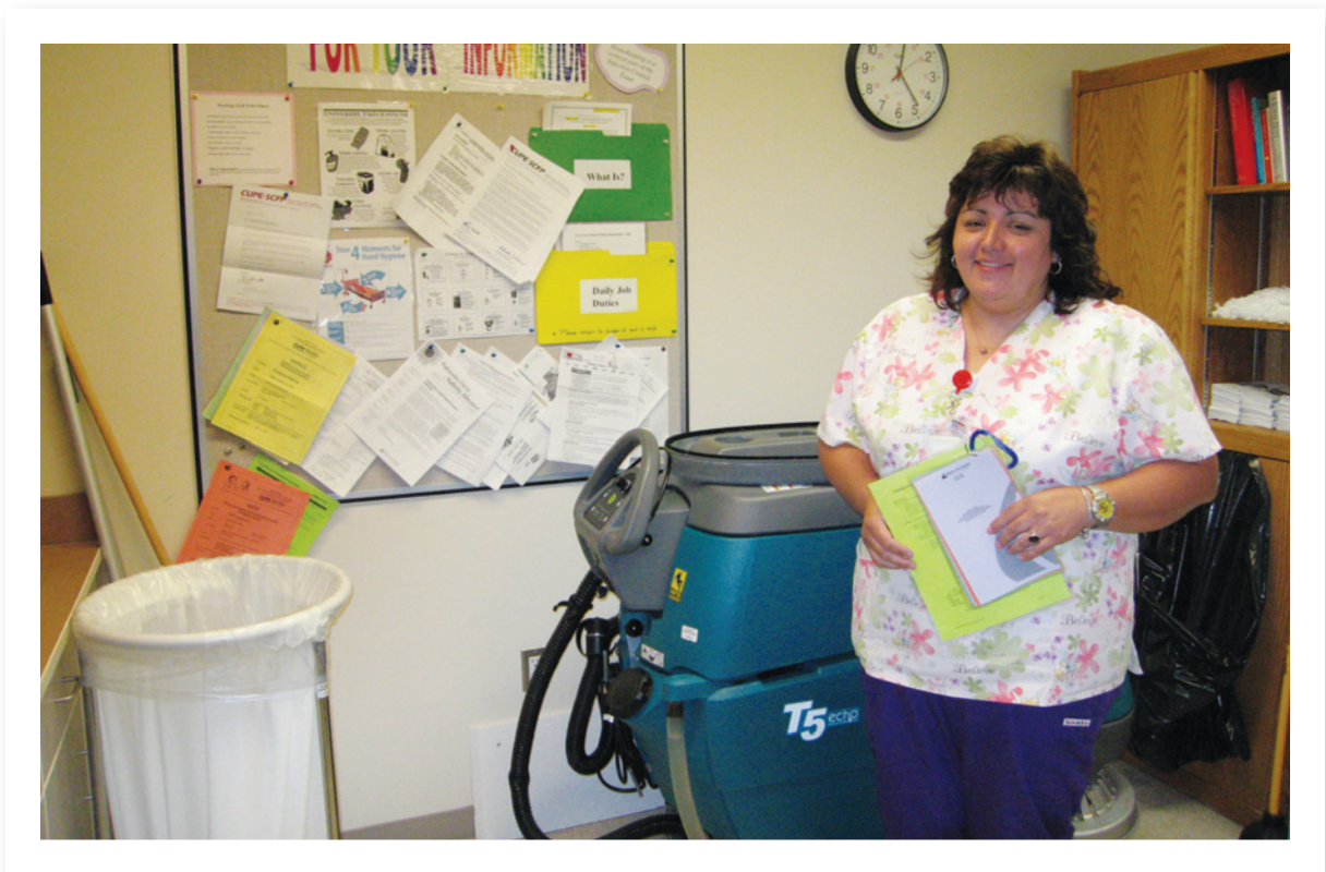
Figure 3 Housekeeping Coordinator, All Nations' Healing Hospital, Fort Qu'Appelle, SK

and communicating about them may be more consistent with the mainstream, western way of learning. To the degree to which an individual learner develops biculturalism, s/he is more able to meld the realities of both worlds and function more effectively and holistically. That is one of the objectives in developing this curriculum and implementing it.