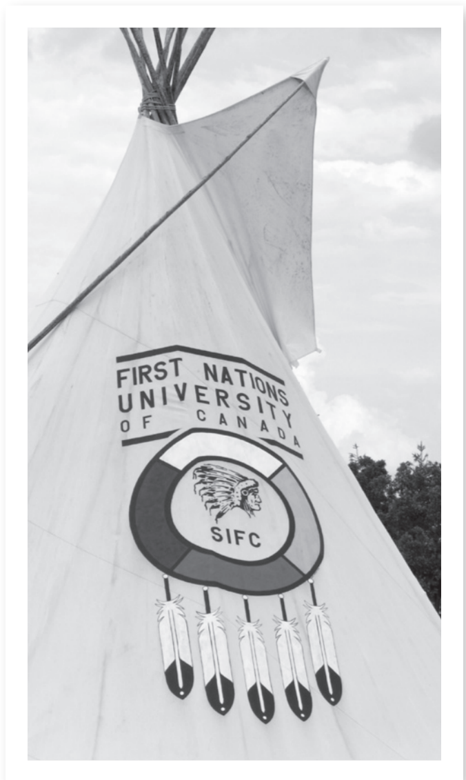
Figure 11 First Nations University of Canada, Regina, SK

Another example of this type of program is the Northern Health Sciences Program in Saskatchewan. It's a 10-month preparatory program offered in partnership between the First Nations University and SIAS, which delivers both academic and life skills development for Aboriginal and non-Aboriginal learners entering health science programs at the post-secondary level. This program's objective is to enhance learner success by providing the necessary academic requirements in biology, chemistry, math and English. This program also serves as an introduction to the health field, with a focus on nursing as a career.